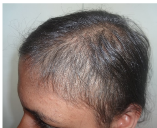
Figure 5: Right temporal view monilethrix new hair growth retained with less breakage.