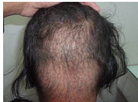
Figure 1: Occipital view monilethrix fragile hair and poor growth.

Dull coarse fragile hair, looking like a short hair style, thinning over frontal, temporal and occipital areas. Hypotrichosis and very short broken hairs over occipital area up to the nape of the neck, here the hair was hardly a centimeter in length with several keratotic papules (Figure 1). Axillary hairs appeared sparse, short and fragile. Eyebrows, eyelashes were normal. Body hair was thin, nails were deformed showed koilonychia. Patient had no other skin lesions, or anomalies [1]. General and systemic examination was normal.