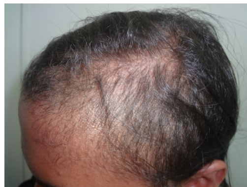
Figure 4: Right temporal view monilethrix fragile hair poor growth.

Within 2 months patient showed better hair growth (Figures 1,3 and Figures 4,5), improved hair caliber and appreciation of hair quality.