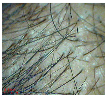
Figure 6: Fewer beaded hair shafts after 4 months of nutritional therapy.

Fragility and hair breakage were reported to be reduced, hair felt stronger. At the end of 4 months the hair caliber had improved by 18%. Hair density had improved by 23%. Number of vellus hair had reduced by 35%. There was improvement in all the five areas, frontal, both