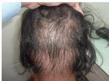
Figure 3: Occipital view monilethrix new hair growth retained with less breakage.

Several hairs had hair breakage at these nodes which appear to be the weak spots (Figure 2). Absence of medulla at the site of the constrictions along the shaft is reported [2], but could not appreciate on routine trichoscopy. Several adjacent hairs were non beaded, normal in appearance but these too were fragile and broken (Figure 2) indicating poor hair shaft formation. There was variation in hair shaft diameter displaying anisotrichosis. Vellus hair and broken hair were found all over the scalp with occasional keratotic papules. Photographs were recorded in five standard views, frontal, right temporal, left temporal, vertex and occipital. Hair counts for density per square centimeter and hair caliber in microns was recorded. These evaluations were compared every two months (Figure 3).